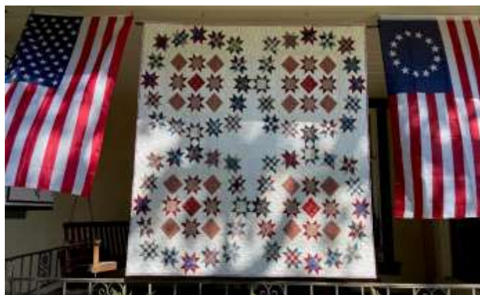
Beth Hasenauer's front porch display with her red/white & blue that grew.