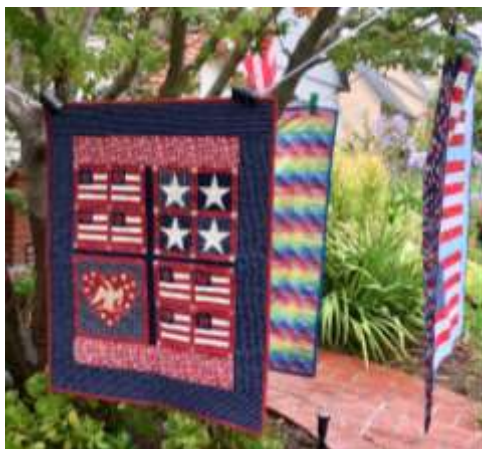
Cindy Abrams front yard