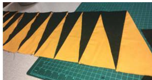
Creating fabric through piecing