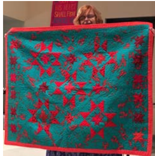
Louis Rupp's Stars