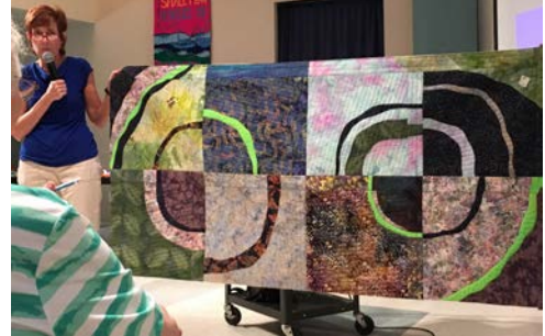
Raza Read's "Quilt as You Go" Quilt