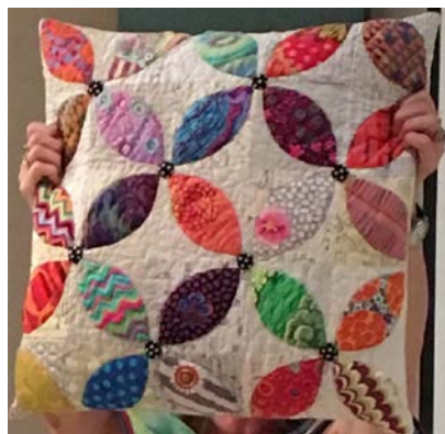
Louise Rupp's Orange Peel pillow created in Becky McDaniel's workshop