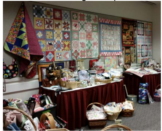
Many items were available.