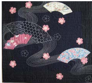
Sashiko and fans