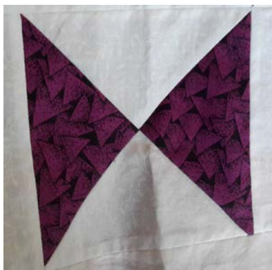
Quarter Square Triangle