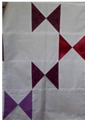
Quarter Square Triangles with rectangle and squares attached

Adapted from villarosadesigns.com "Purple Haze"