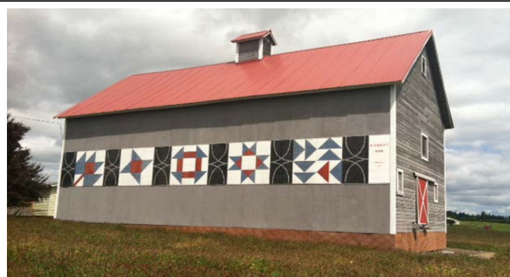
While visiting Oregon we came across this barn in Yamhill, Oregon where my mom went to school as a young girl.