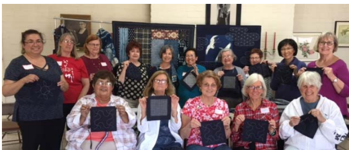
Nancy Ota Workshop attendees show off their work!