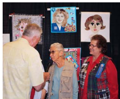
Friendship Group Interview